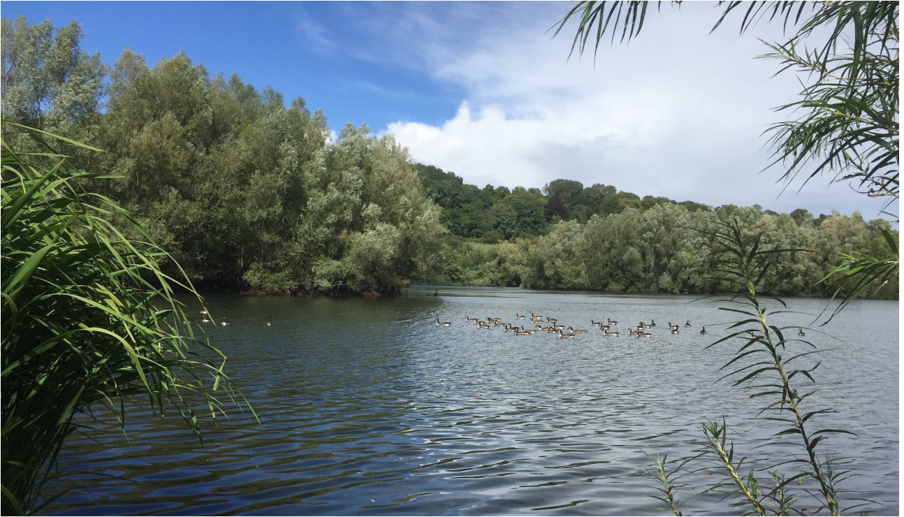
Cam 1 18 th August A flock of Canada Geese

The cams photographed deer and foxes at night as follows: